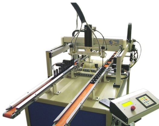
Automated Epoxy Application Dual Head Dual conveyor with sensors and stops automates epoxy dispensing from 55 g drum.