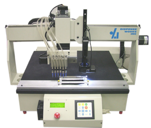
6 Head Dispensing with Automatic Vision Custom programmable six head tip shuttle mechanism & glass programmable syringes.