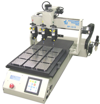
Three Head Epoxy Dispensing on Pallets Unique system features 3 way adjustable valve / syringe mount. Electronic fixturing.