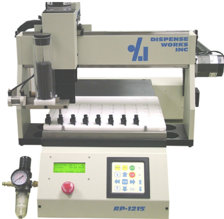
Powder Dispensing System Unique positive volume powder dispense head fills mini cassettes.