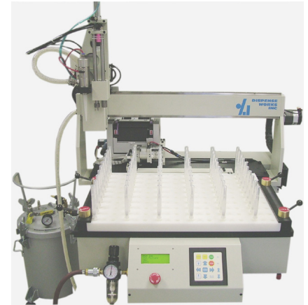
Tooth Whitening Case System Dispenses gel, press on brush, snap on cap, applies label automatically.