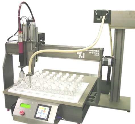
Capping & Filling with Peristaltic Pump Uncaps, fills, re-caps bottles to a programmable torque. File based controls.