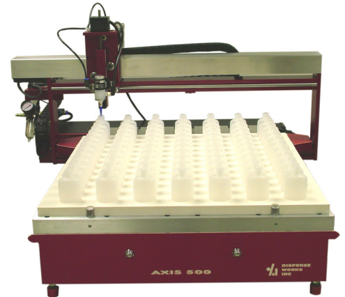
Axis 500 Production CA Fill system Palletized filling of adhesive into different sized containers & vials.