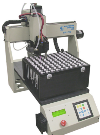
Silicone Applicator with Poking Head Custom medical application "pushes" silicone into component.